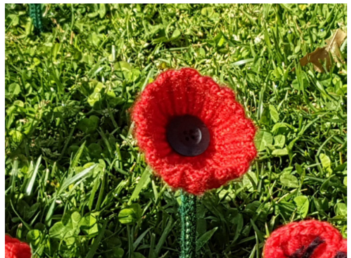
One of Jeanne's poppies on display