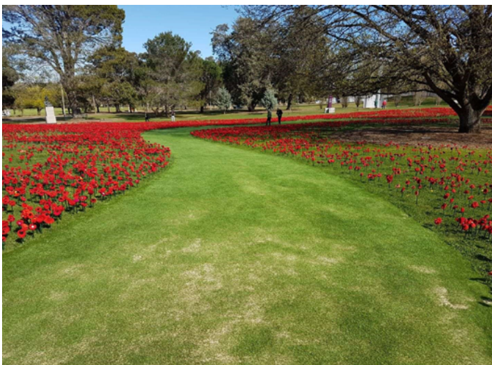
Display of knitted poppies at the Australian War Memorial in Canberra